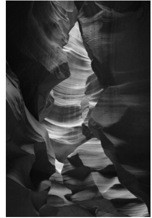
Antelope Canyon