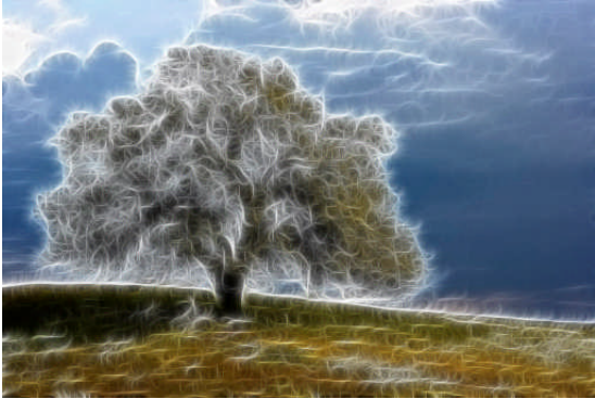
Fractal Oak Craig Hadfield