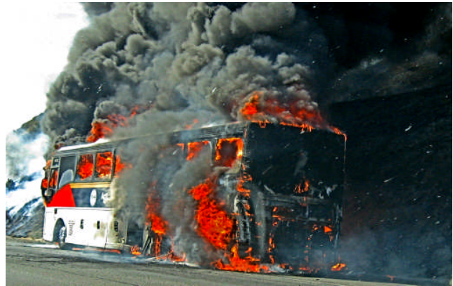
Nest Time Take The Train Herb Spencer