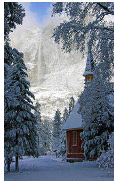
Chapel and Falls Loye Stone