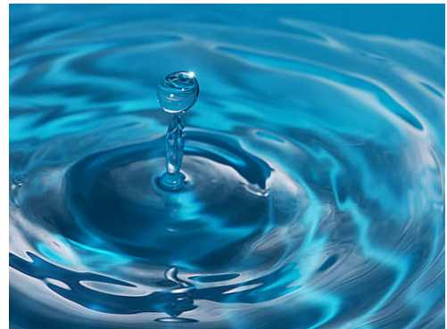
Water Drops in Blue Craig Hadfield