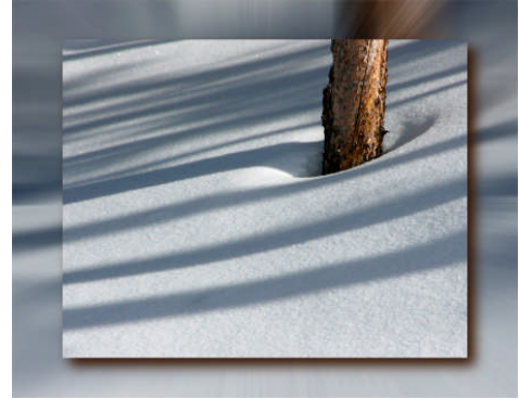
Trunk and Shadows