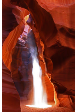
Canyon Light Loye Stone