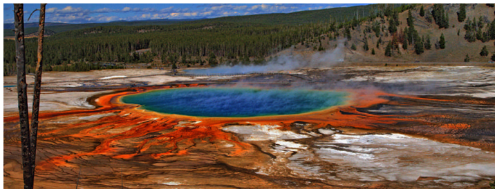
Prismatic Color Herb Spencer